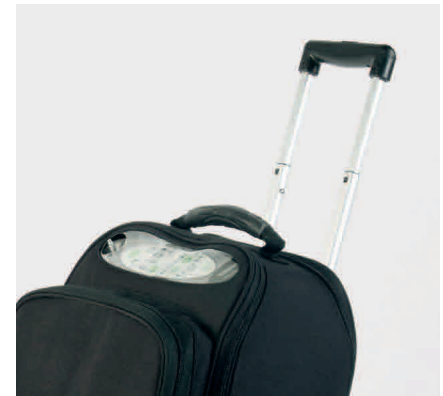
Wheeled carry case showing extendable handle