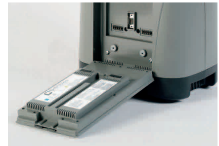
iGo Lithium ion Battery

DJMed Pty Ltd Suite 10/20 Barcoo St Roseville, NSW 2069 0421 115 992 www.dearjane.com.au